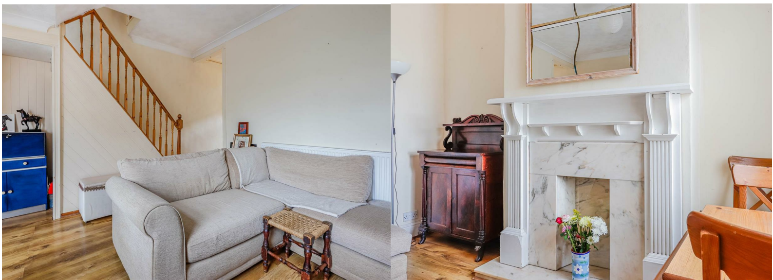
St Oswald's Road, Barry, CF63 2JW